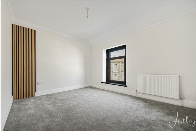
Double glazed window to front, radiator.