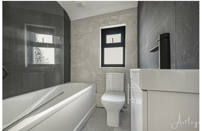
The bathroom features a newly fitted three piece suite comprising a bath with shower over, wash hand basin and WC. Tiled walls and a frosted double glazed window to the side.