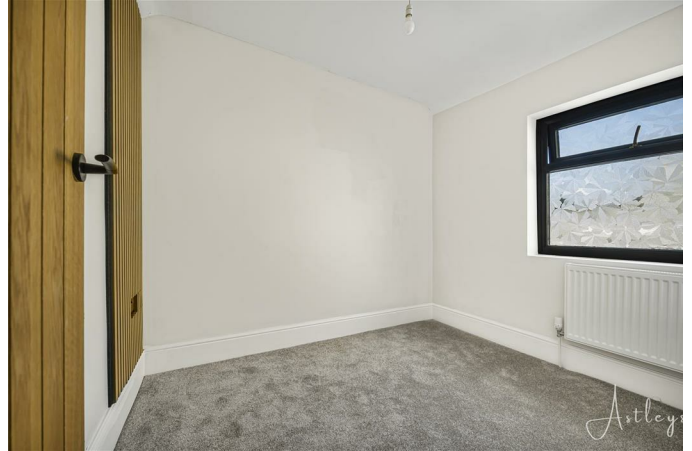
Frosted double glazed window to side, radiator.