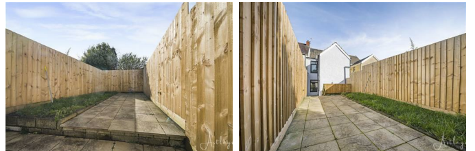
The rear garden is fully enclosed and designed for low