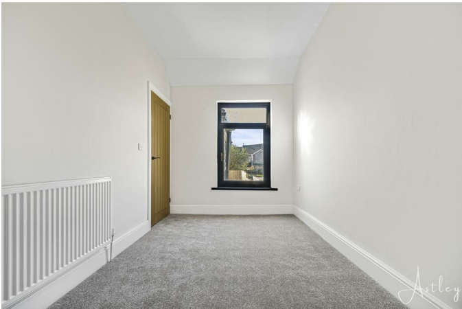
Double glazed window to rear, radiator.